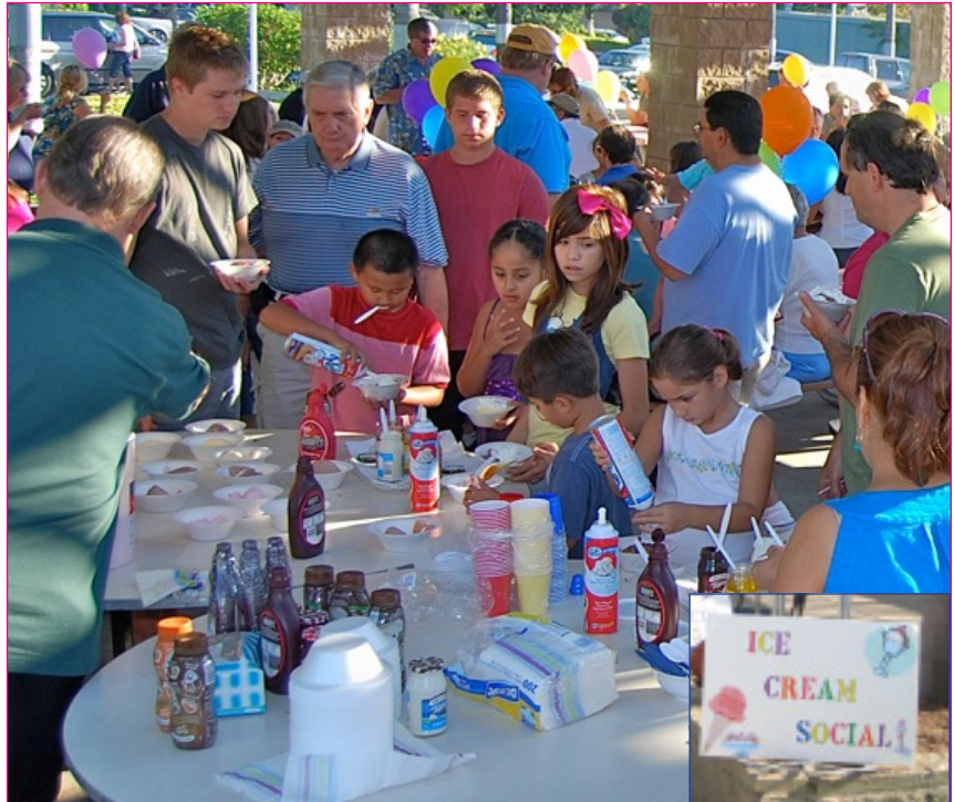
STANDING ROOM ONLY: Parishioners and guests of all ages gather around the toppings table.