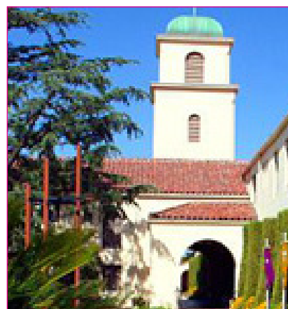
Mater Dolorosa Center